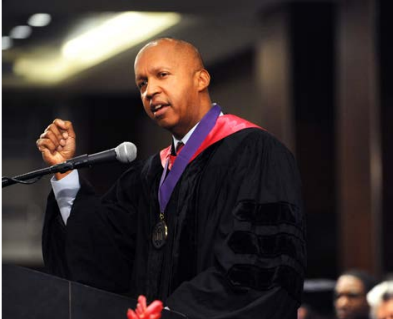
Nationally acclaimed human rights attorney Bryan Stevenson delivered the keynote to John Marshall's January graduating class. The Harvard Law School grad and Founder and Executive Director of Alabama's Equal Justice Initiative has defended death row inmates and other clients underrepresented in society. He recently was named one of TIME Magazine's 100 most influential people of 2015, and his human rights work was featured in the May 2015 issue of Vanity Fair. He told John Marshall's graduating class: "You will have the opportunity to stand for justice. I hope you'll do it."